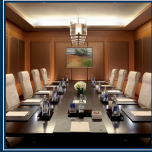
:: Conference Hall ::