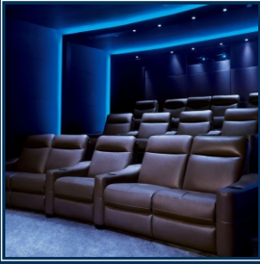
:: Private Theatre ::