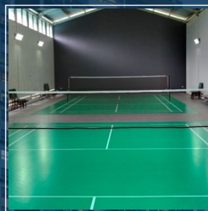
:: Badminton Court ::