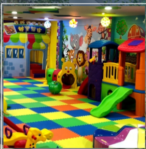
:: Kids Play Zone ::