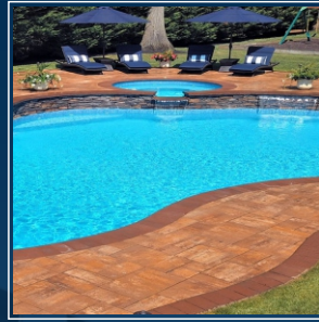
:: Swimming Pool :: (separate for adults and kids)