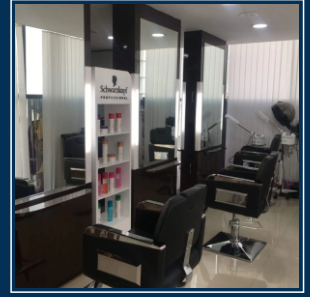
:: Unisex Salon ::