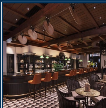
:: Lounge Bar ::