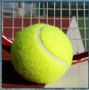
:: Tennis Court ::