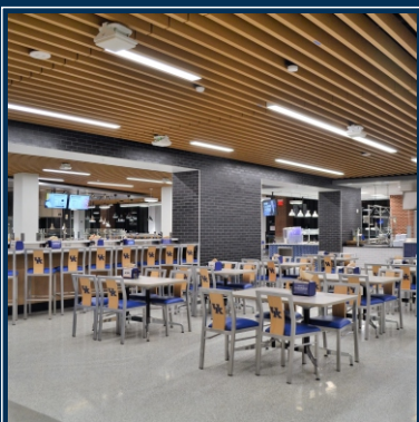
:: Cafeteria ::

Empire comes with a plethora of modern amenities. Our five-star clubhouse is equipped with a wide range of recreational amenities such as: