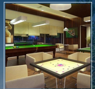
:: Indoor Games ::