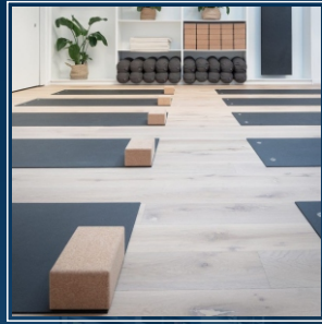
:: Yoga Room ::