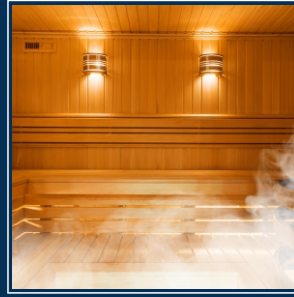
:: Sauna and Spa ::