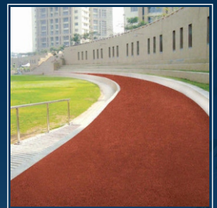
:: Jogging Track ::